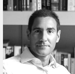
Achilles Risvas Capital Markets and Fintech